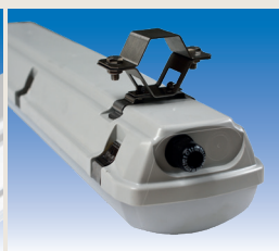
Clamp for mounting on a boom with Ø 50 mm EXV008

– Further models on request / subject to change and error –