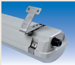
Set of 45° metal brackets for wall mounting (2 pcs.) EXV006