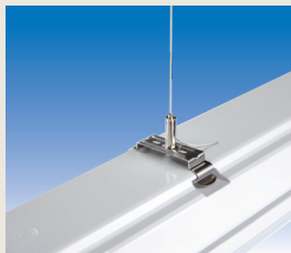
Self-locking cable suspension (3 m) EXV007