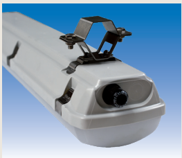
Clamp for mounting on a boom with Ø 50 mm EXV008

– Further models on request / subject to change and error –