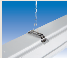
Wire bracket for chain suspension (without chain) EXV005