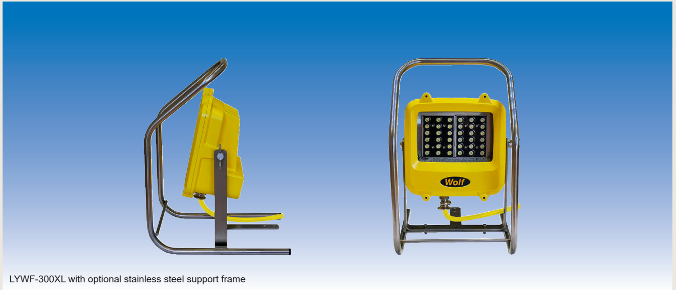
LYWF-300XL with optional stainless steel support frame