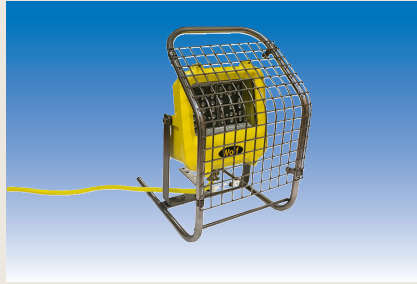
safety mesh LYWF-480