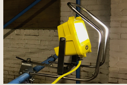
scaffold attachment kit LYWF-699