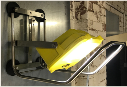
magnet set LYWF-545