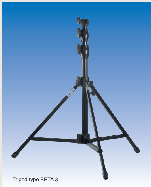
Tripod type BETA 3