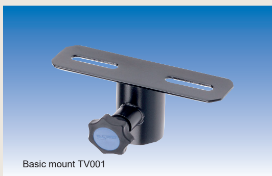
Basic mount TV001