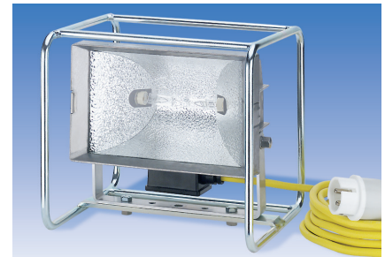
fig. with accessory F95 stackable carrying frame