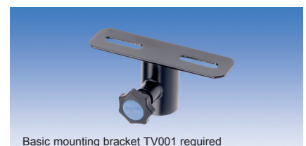
Basic mounting bracket TV001 required

– other models on request / subject to modification and errors –