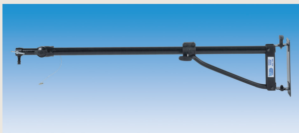
GIRAFFE Type W

*Material: AL = aluminum, black anodized