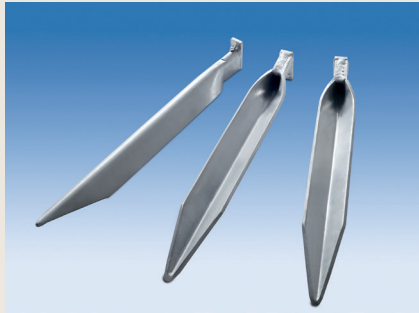
THW – article number: 6230T22398