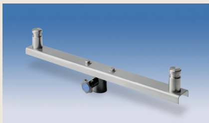
Cross bar including basic mounting support and DIN pins