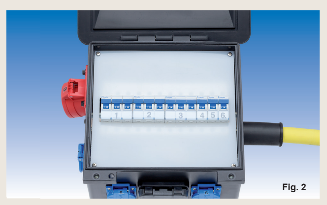
with internal protective device