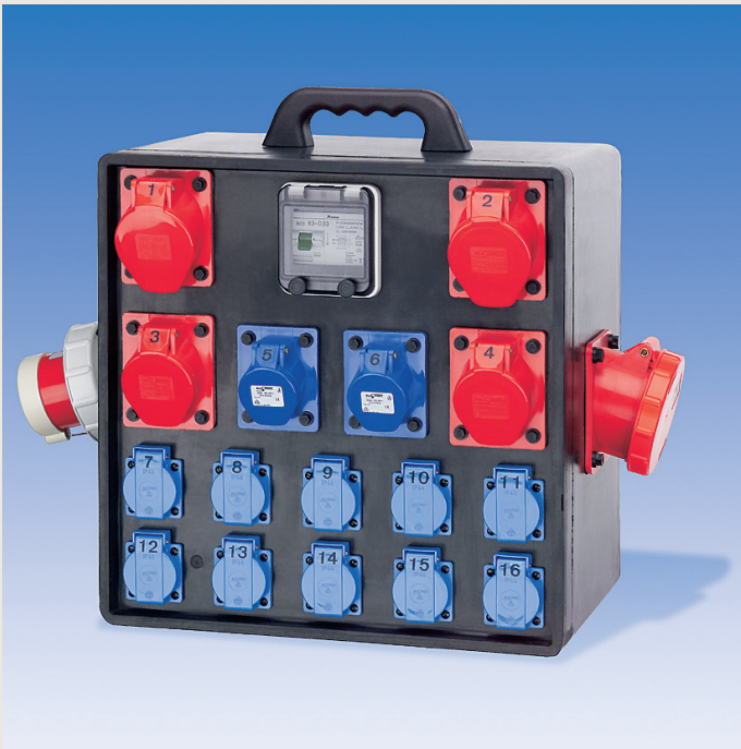
Configuration examples 1 and 2 of over 300 already assembled varieties