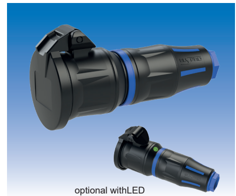
optional with LED